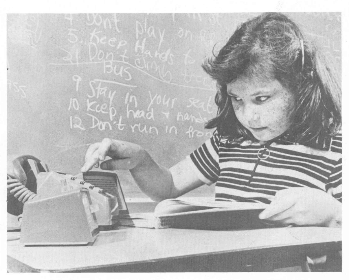
Computerized Word Pronouncer

Workable, Sound, Data Processing Decisions The Computer and The Community College The Satisfaction of Companies with Service Bureaus Computers and Dossiers — I Common Sense, Wisdom, General Science, and Computers — II